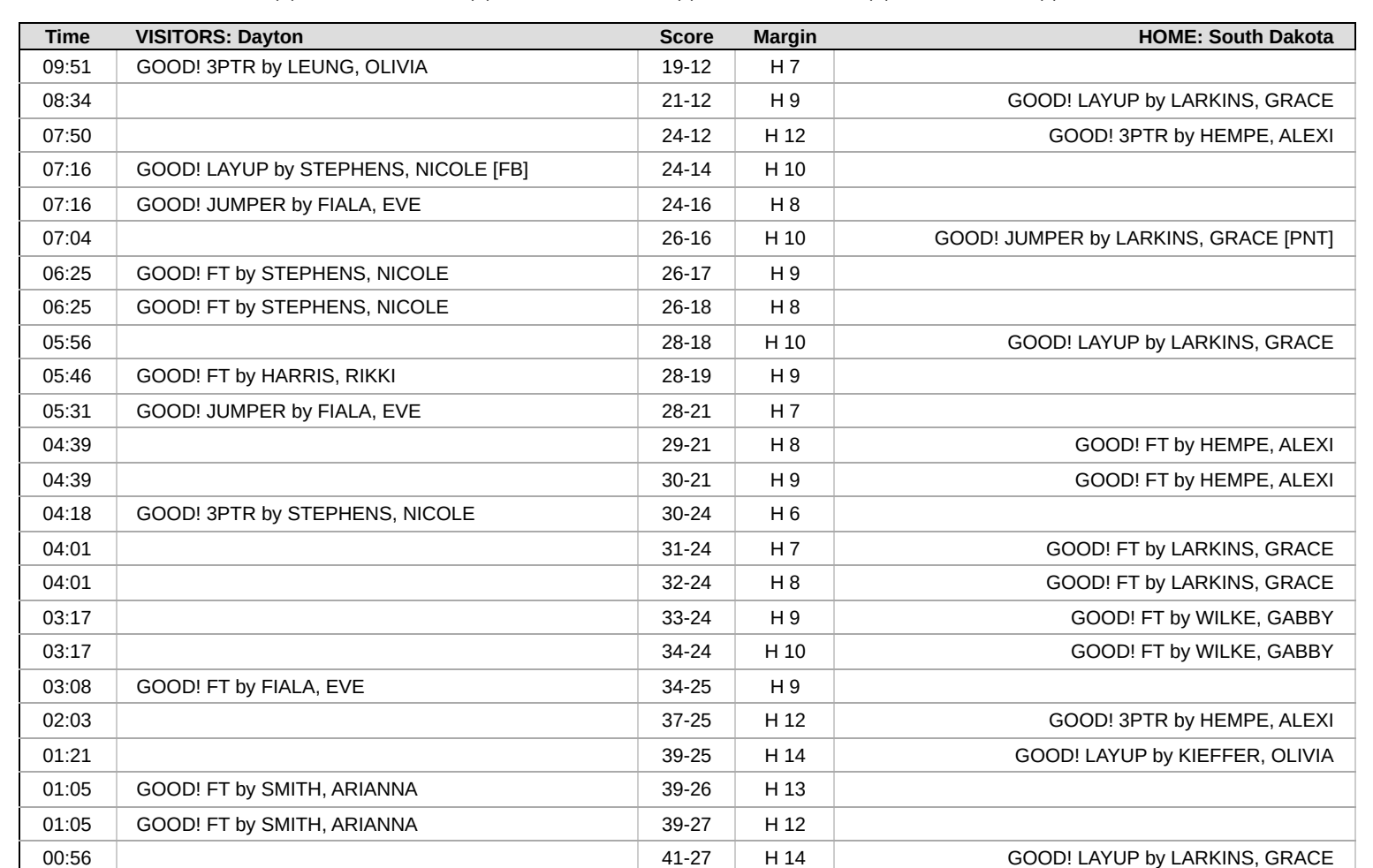
Dayton 29, South Dakota 41