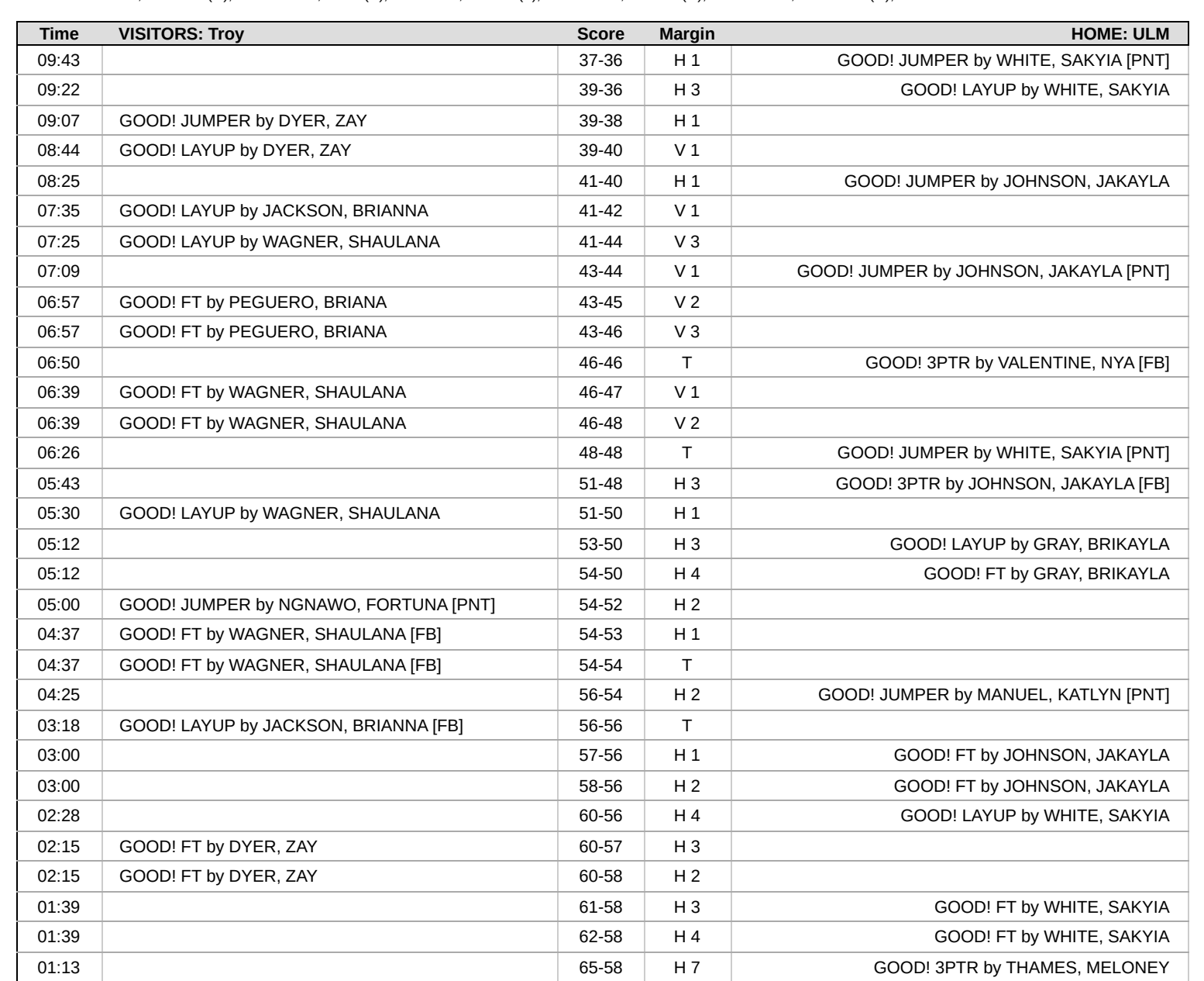
68-58 Н Troy 58, ULM 68