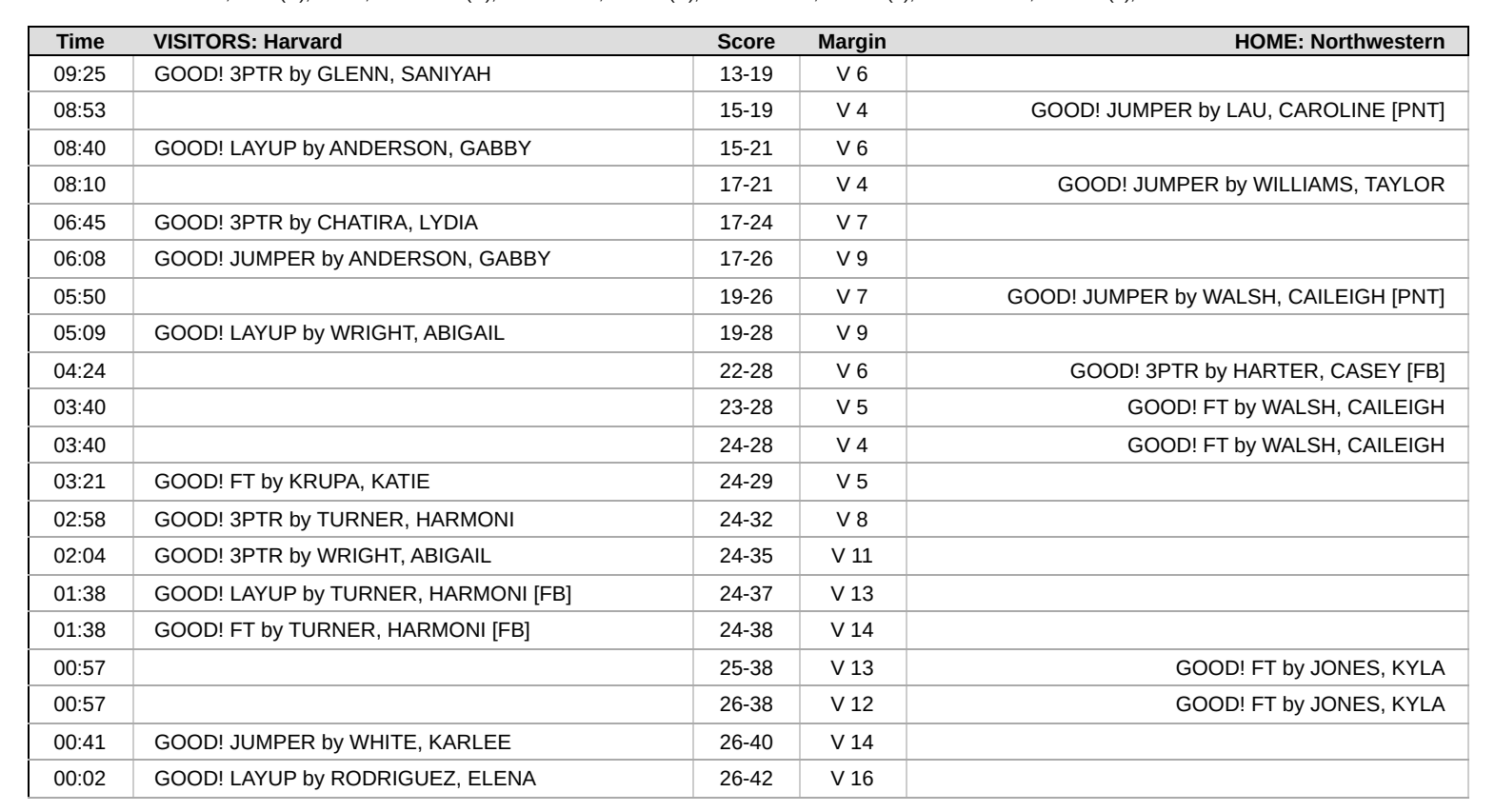
Harvard 42, Northwestern 26