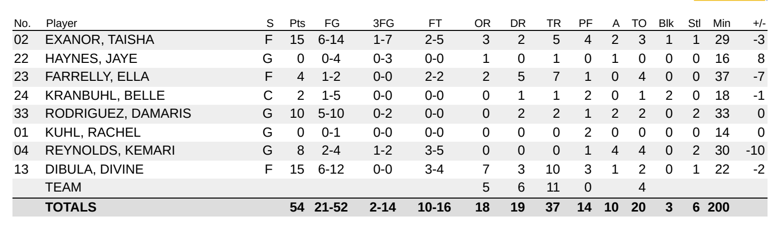
Shooting By Period