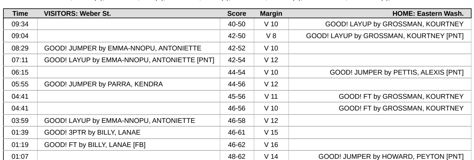
Weber St. 62, Eastern Wash. 48