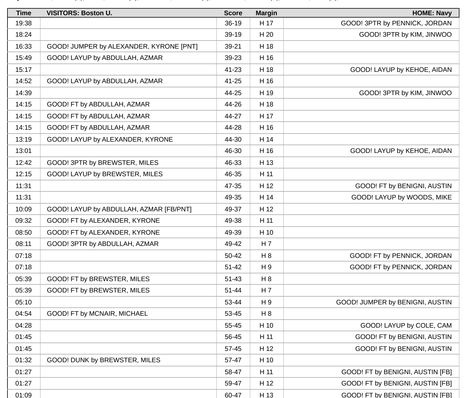
Boston U. 47, Navy 62