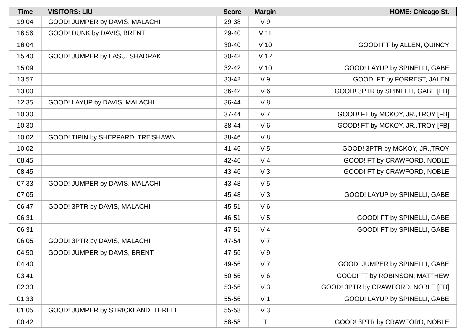
LIU 58, Chicago St. 58