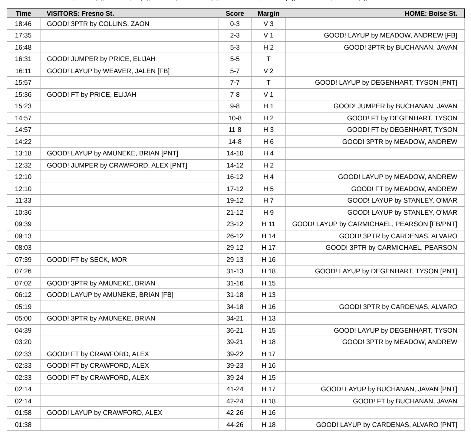
Fresno St. 26, Boise St. 44