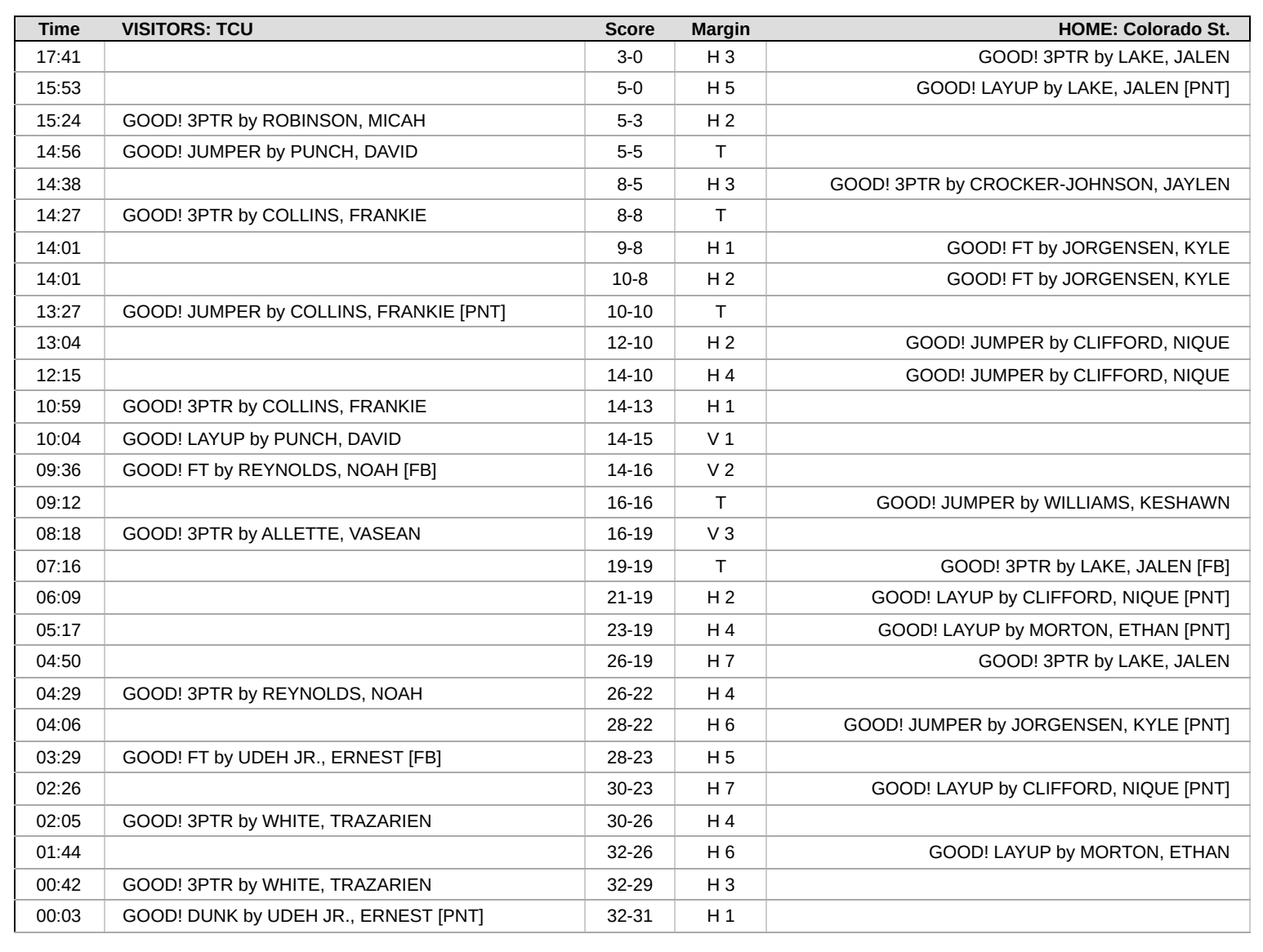
TCU 31, Colorado St. 32